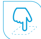
PAPER TOUCH MATT LACQUER