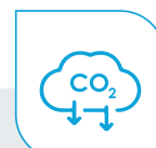
CO 2 REDUCTION