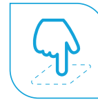
PAPER TOUCH MATT LACQUER