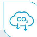
CO 2 REDUCTION